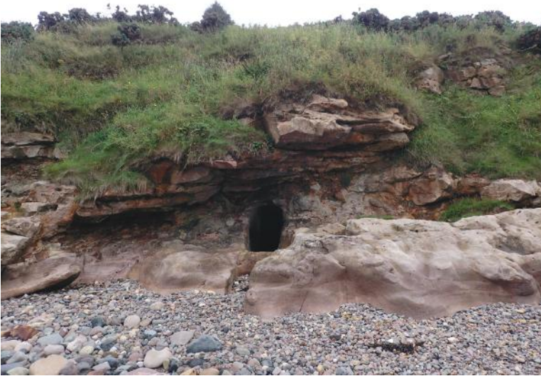
Fig. 1. — Entrance to Cockburnspath coal mine, Berwickshire.