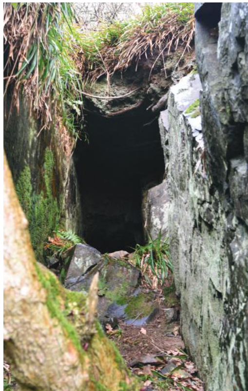
Fig. 2. — Entrance to Duns2 copper mine, Berwickshire.