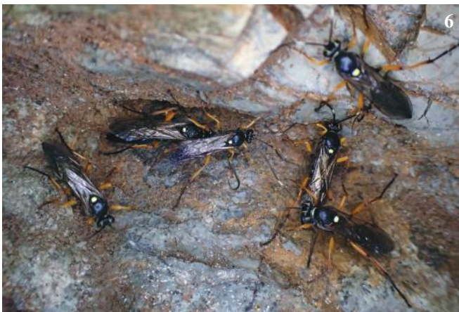
Figs 3–6. — Female Diphys quadripunctorius (Müller): 3, in Duns2 copper mine, Berwickshire on 14.iii.2019. The body is about 15mm long; 4, two specimens in a cave at Gullane, East Lothian on 12.ix.2017; 5 & 6, aggregations at Duns2, Berwickshire on 12.viii.2019.