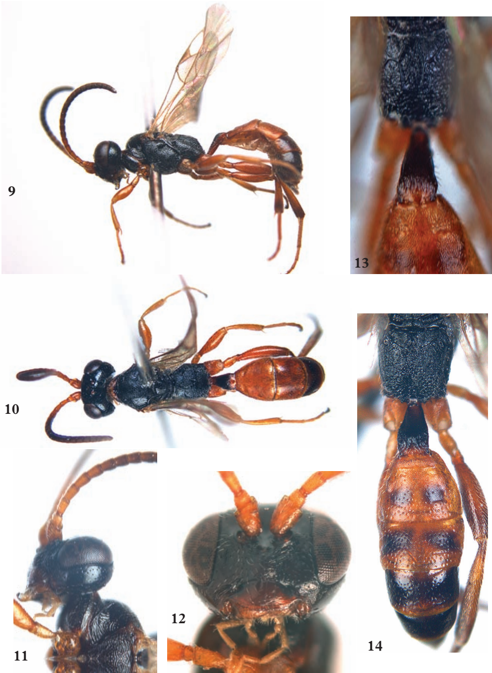
Figs 9–14. Aethecerus ruberpedatus sp. nov., ♀. 9, habitus, lateral view; 10, habitus, dorsal view; 11, head, lateral view; 12, head, ventro-facial view; 13, propodeum and basal part of metasoma, dorsal view; 14, propodeum and metasoma, dorsal view. (9, 10 holotype; 11–14 paratype.)