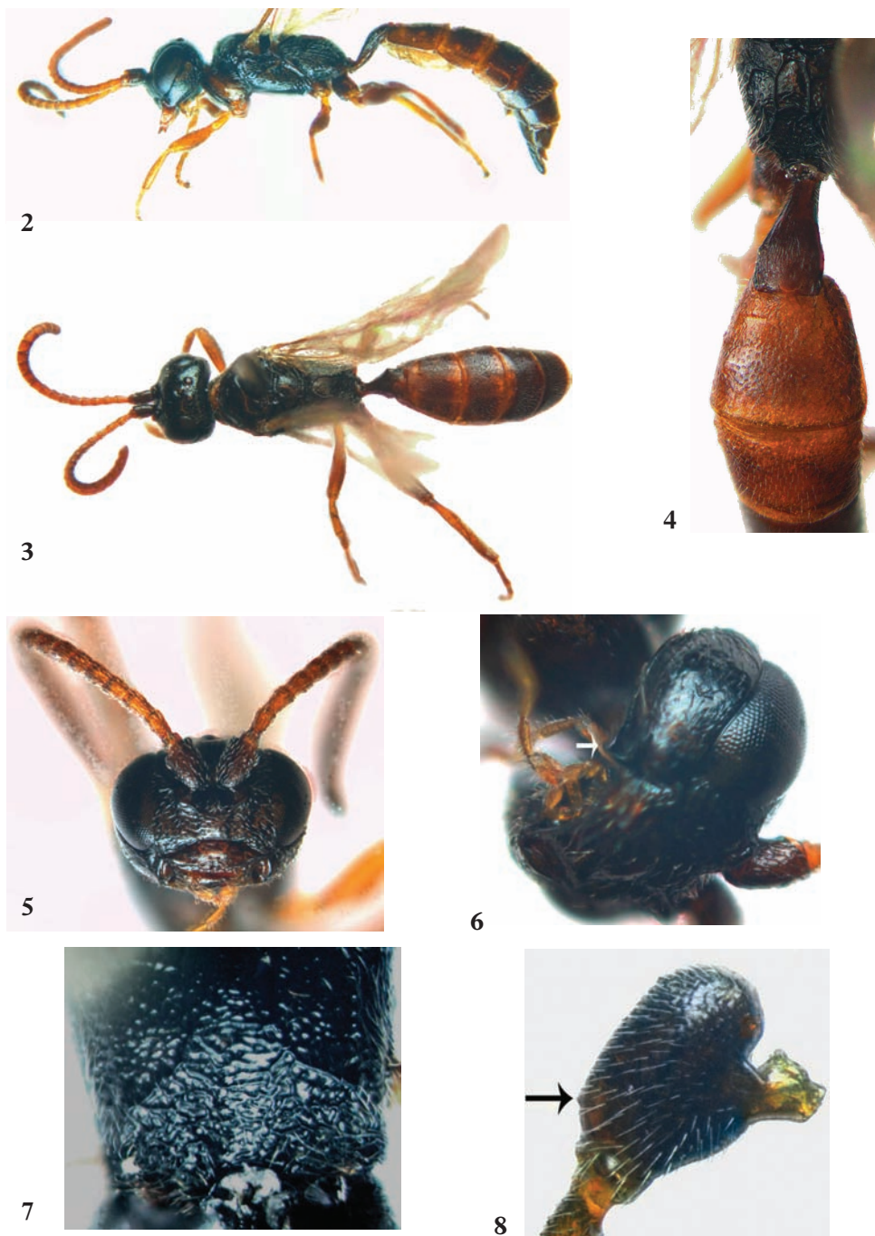
Figs 2–8. Aethecerus horstmanni sp. nov., ♀. 2, habitus (except wings), lateral view; 3, habitus, dorsal view; 4, propodeum and basal tergites of metasoma, dorsal view; 5, head and basal part of antenna, facial view; 6, head, antero-latero-ventral view, to show genal carina (arrowed); 7, posterior part of propodeum, postero-dorsal view; 8, hind coxa, lateral view, to show tubercle (arrowed). (2, 3, 8 holotype; 4–6 paratype.)