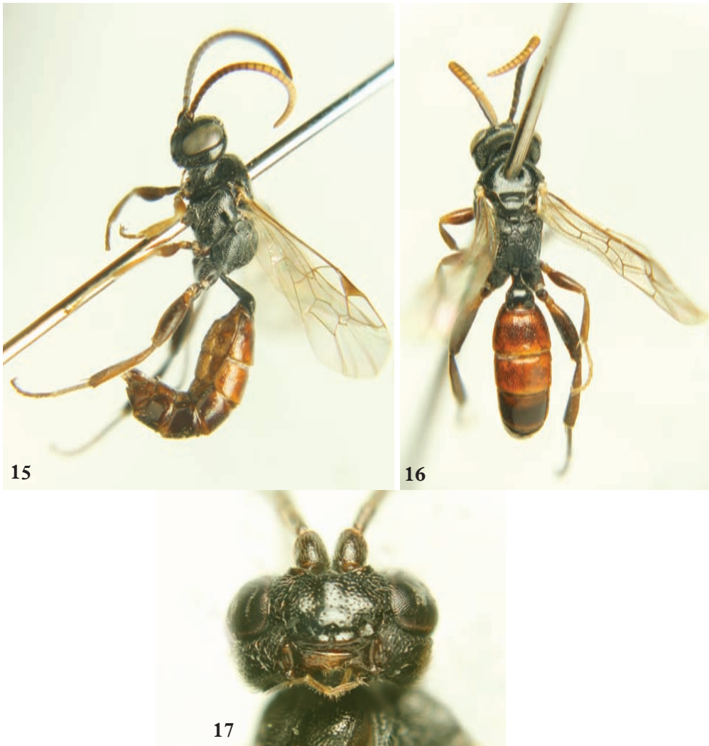
Figs 15–17. Diadromus nitidigaster sp. nov., ♀. 15, habitus, lateral view; 16, habitus, dorsal view; 17, head, ventro-facial view. (15, 16 holotype; 17 paratype).

Hansen & G. Walberg (in ZSM). Netherlands: 1 ♀, Kapellebrug, Zeeland, 24.v.2011 ( C. J. Zwakhals ) (in coll. Zwakhals).