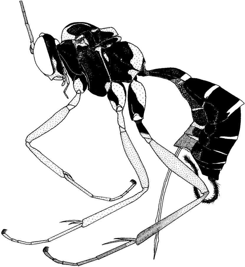
Fig. 16. Phytodietus maculator sp. nov. Habitus and colour pattern of female.